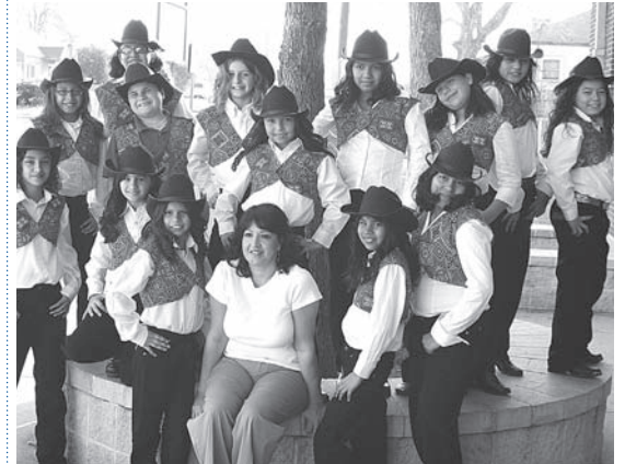
Steele's Little Broncos dance team performed at the Denver conference where the school was honored.

Joining Steele in Denver were representatives from 2006 "Middle School of the Year" recipient Harris , and from Bowden ES . While there, students had the opportunity to discuss youth-related concerns while meeting with an aide to First Lady Laura Bush.