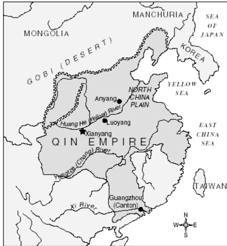
Qin Empire—Ancient China

Level 3 questions require students to make a generalization, make an inference or draw conclusions from a map or series of maps.