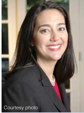
Erin Gruwell keynote speaker