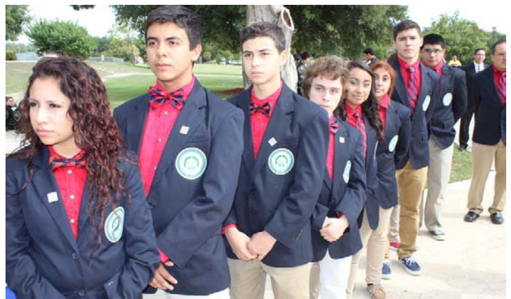
Jefferson HS Architecture & Environmental Studies Magnet students stand ready to welcome guests to the Go Public campaign kick off.