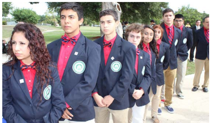
Jefferson HS Architecture & Environmental Studies Magnet students stand ready to welcome guests to the Go Public campaign kick off.