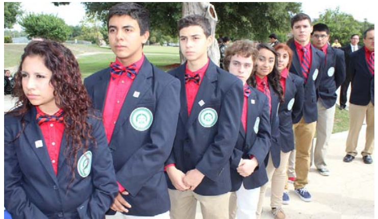
Jefferson HS Architecture & Environmental Studies Magnet students stand ready to welcome guests to the Go Public campaign kick off.