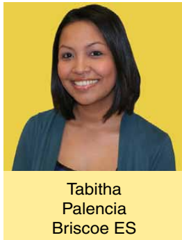
Tabitha Palencia Briscoe ES