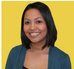
Tabitha Palencia Briscoe ES