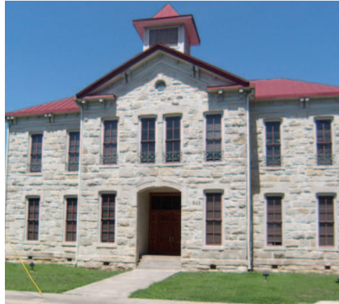
The former Navarro ES now serves as an alternative high school of choice. Its three oldest buildings were placed on the National Register of Historic Places in 1975.

other sites until its building was completed in 1926.