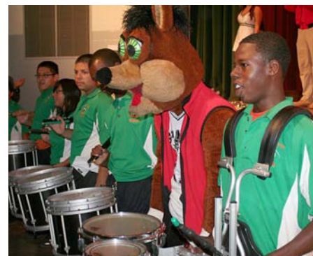
The Spurs Coyote teams up with the Sam Houston HS drumline for an announcement that Spurs Sports & Entertainment will provide funding to City Year San Antonio for City Year's Whole School, Whole Child program at the East Side campus.