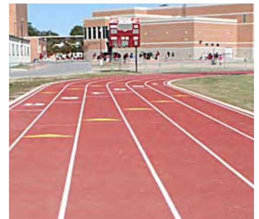
Ready for student and community use is the new Highlands HS six-lane, all-weather track. Highlands was one of three high schools whose athletic tracks were finished in October.