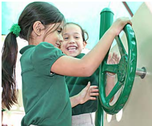
Students at Briscoe ES enjoy their new playground, which was the first elementary school to receive them.

Track upgrades were completed in October at Edison, Highlands and Sam Houston, and the first