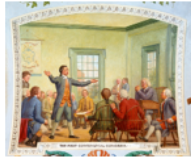
1st Continental Congress

http://upload.wikimedia.org/wikipedia/commons/9/99/Flickr_-_USCapitol_-_The_First_Continental_Congress%2C_1774.jpg