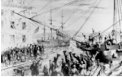
Boston Tea Party