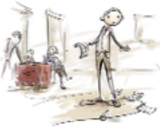
Second Continental Congress