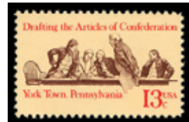
Articles of Confederation

http://commons.wikimedia.org/wiki/File:Stamp_US_1977_13c_Articles_Confederation.jpg