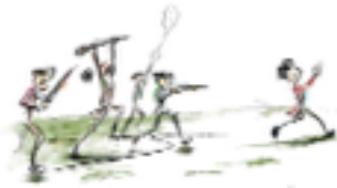
Lexington and Concord

http://upload.wikimedia.org/wikipedia/commons/9/99/Flickr_-_USCapitol_-_The_First_Continental_Congress%2C_1774.jpg