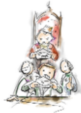
Olive Branch Petition