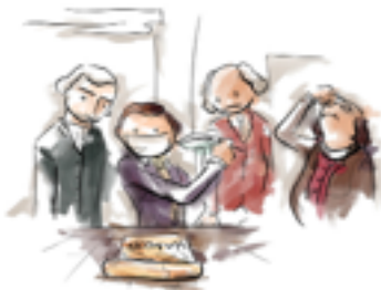
Declaration of Independence

http://commons.wikimedia.org/wiki/File:The_Battle_of_Bunker_Hill.jpg