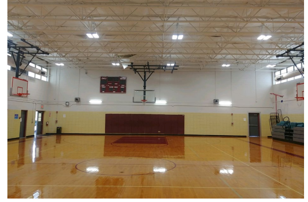
Post-retrofit gym with LED lighting