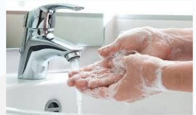
Hand sanitizing stations