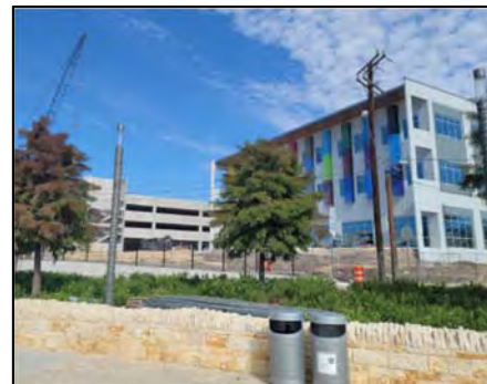
Central Administration Building