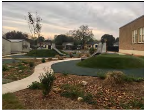
Rodriguez – Outdoor Playground