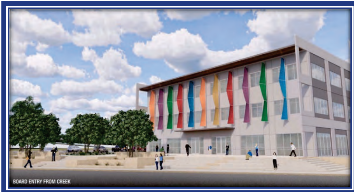
New Administration Building - Rendering