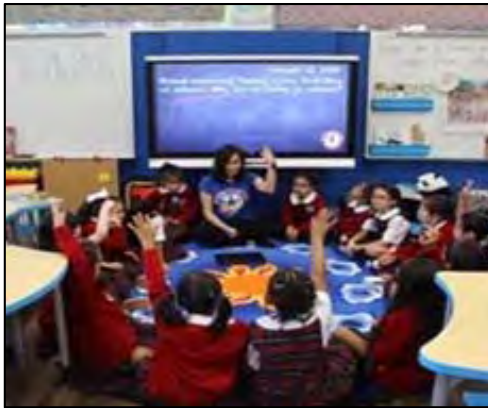
YWLA Primary Phase II - Classroom