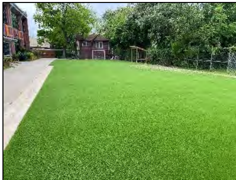
Bonham Artificial Turf