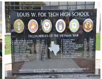
Fox Tech Memorial