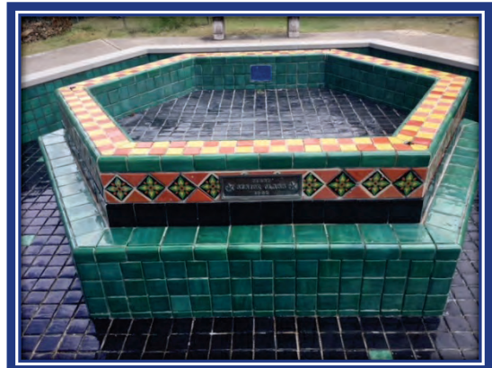
Jefferson HS – Fountain Restoration