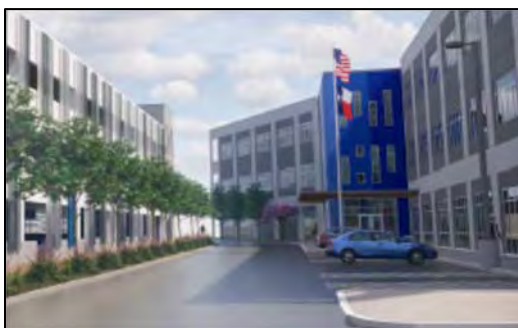
Central Administration Building