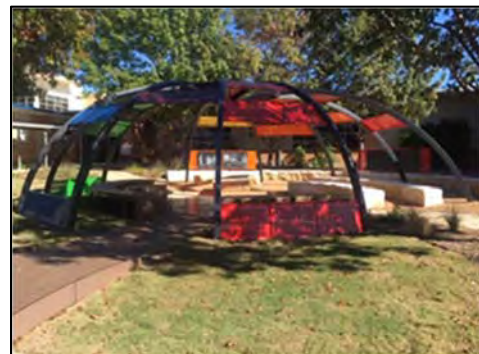
Democracy Prep - Courtyard Modifications