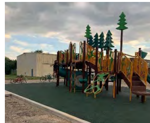
Page Community Project