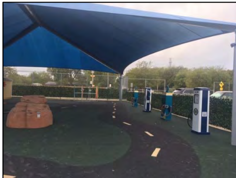
Carroll ECEC - Outdoor Learning