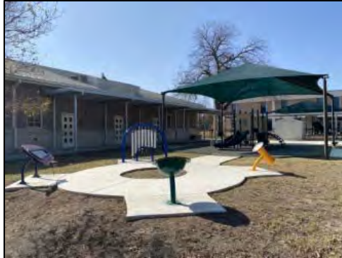
Head Start Huppertz